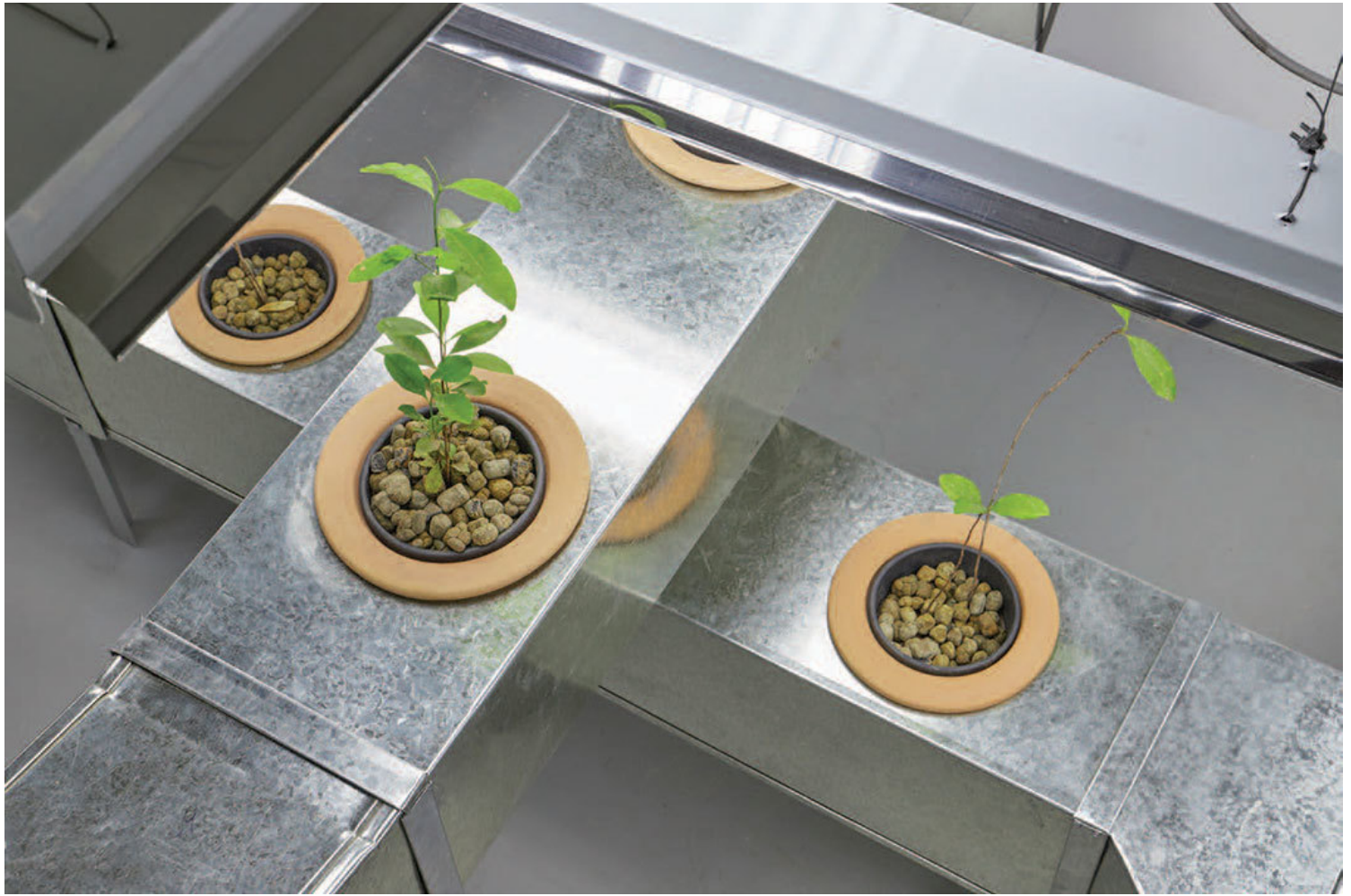
Ximena Garrido-Lecca, Botanical Readings: Erythroxylum coca , 2019, coca plants, hydroponic system, galvanized steel ducts, lighting. Installation view, Proyecto AMIL, Lima, Peru.