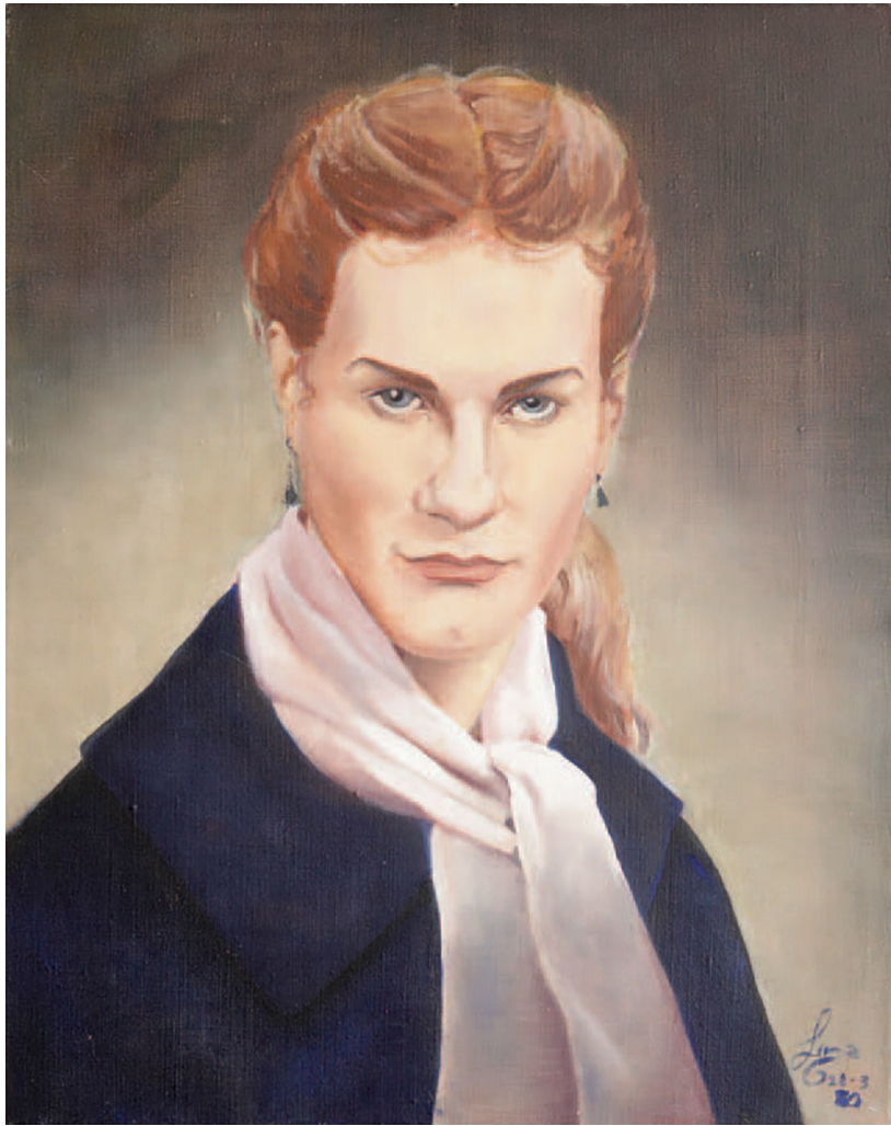
Lorenza Böttner, untitled, 1980, acrylic on canvas, 21 5/8 × 18 7/8".