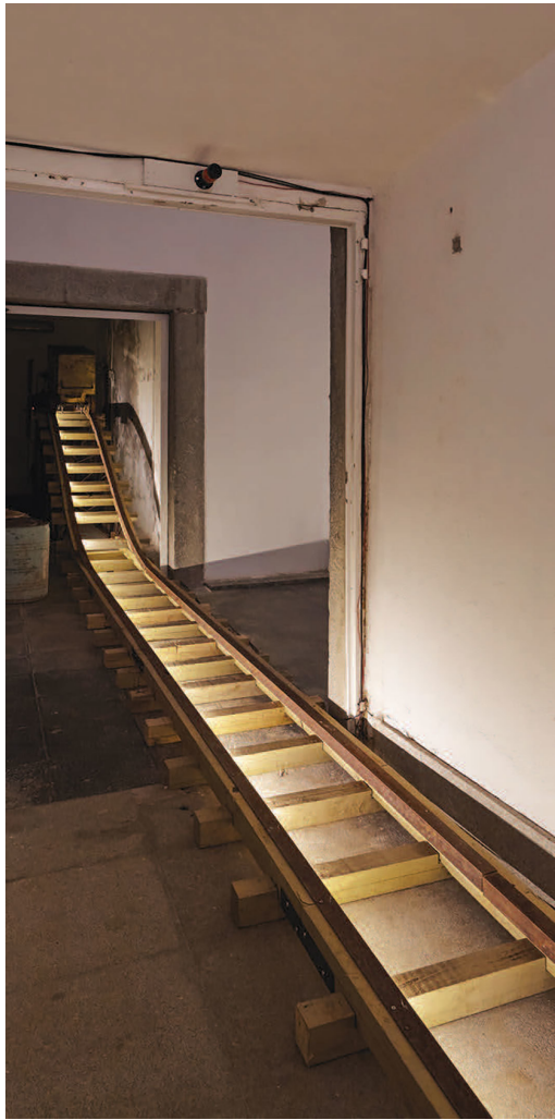
View of “ Mapa Teatro: Of Lunatics, or Those Lacking Sanity, ” 2018–19, Museo Nacional Centro de Arte Reina Sofía, Madrid.