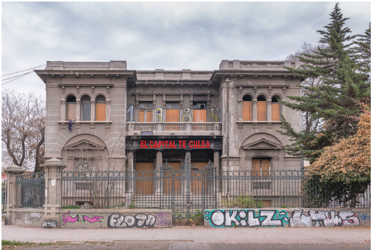
Teresa Margolles, El capital te culea (Capital Screws You), 2019, ink-jet print, 59 × 88 1/2".