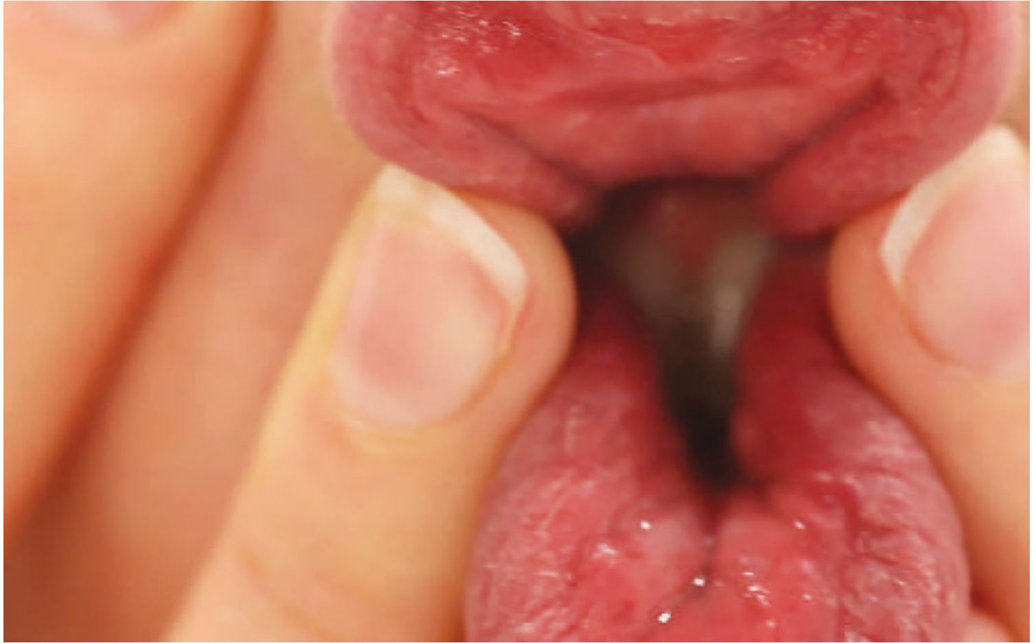
Mercedes Azpilicueta, Un mundo raro (A Rare World), 2015, three-channel video projection, color, sound, 10 minutes.

Museo Experimental El Eco this past summer, Rincón Gallardo delved into violent imperial histories, narrating what the artist calls a mythical-critical fable where blood is a metaphor for the colonial regime that intoxicates the world.