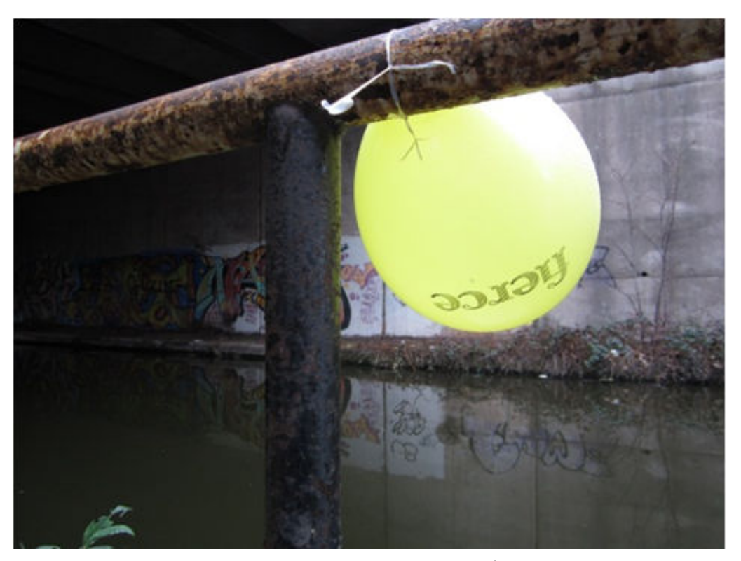
Figure 1. On route to Track

4.1 Graeme Miller's installation Track comprised 100m of 'dolly track'<sup>[5]</sup> installed on scaffolding underneath the Gravelly Hill Interchange of Birmingham's infamous 'Spaghetti Junction'<sup>[6]</sup>. Visitors first had to find the location, tucked under the raised knotty intersection at which roads, rail and canal interweave, transporting thousands of vehicles through, in and out of Birmingham. The walk to the site of the installation took participants through long, dark, dripping tunnels with flashes of surprising urban beauty in the form of light from the motorway above lighting the graffiti, and reflecting it onto the canal's still surface (see Figures 1 and 2).