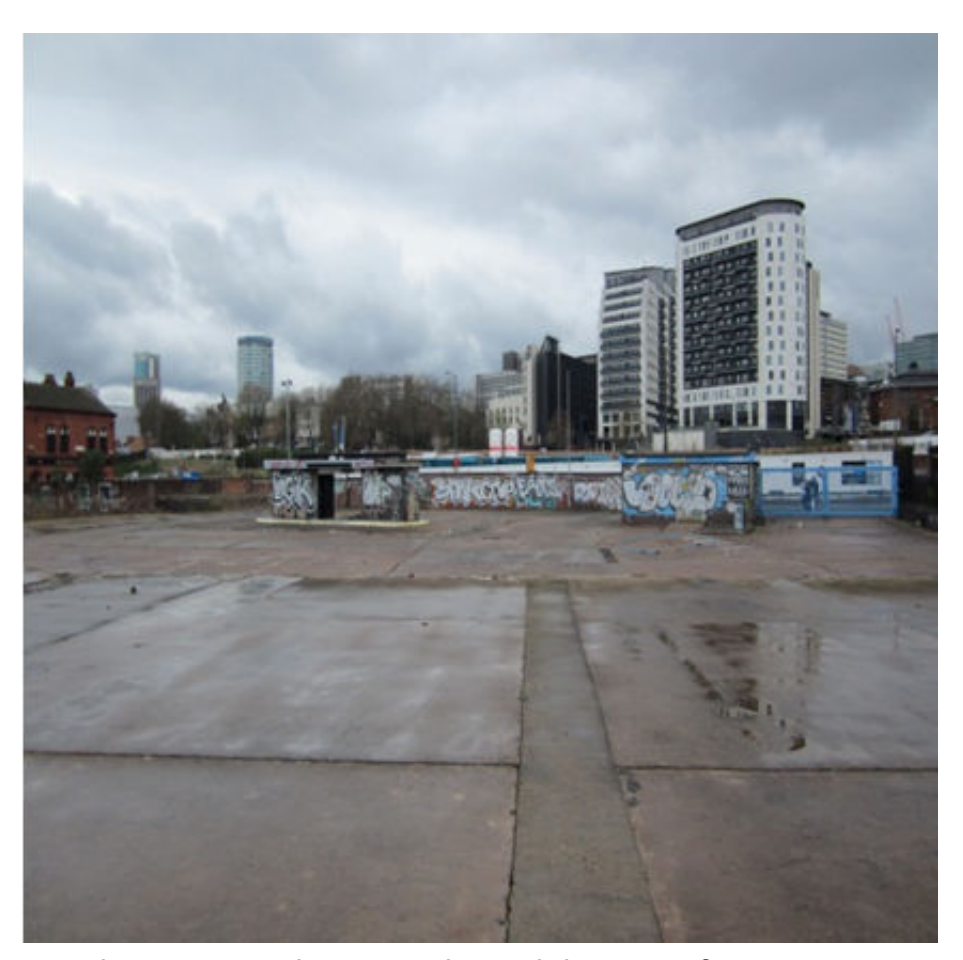
Figure 4. The regenerated cityscape beyond the ruins of Curzon Street car park

4.9 Hamish Fulton's Group Walk generated similar political possibilities. For this, over sixty members of the public congregated to create a collective walking artwork on an expanse of abandoned car park at Birmingham's disused Curzon Street railway station. Like the location for Track , this place is embedded in the historical and geographical imagination of the city, and yet is a marginalised space dramatically at odds with the aesthetic of the regulated and regenerated urban spaces which surround it (and into which it will, at some point in the near future, be subsumed). Antagonistic symbolisms abound. The space is flanked by the landmark Millennium Point (<a href="http://www.millenniumpoint.org.uk/>">http://www.millenniumpoint.org.uk/></a>, 'a catalyst for the continued regeneration of Birmingham' (see Figure 4) and a mainline railway which runs in and out of the city. At the top end, there is one of the increasingly ubiquitous privately financed new-build student accommodation blocks (Figure 6), standing opposite the 1838 former railway entrance, now a listed building sitting incongruously amidst the ruins (Figure 5).