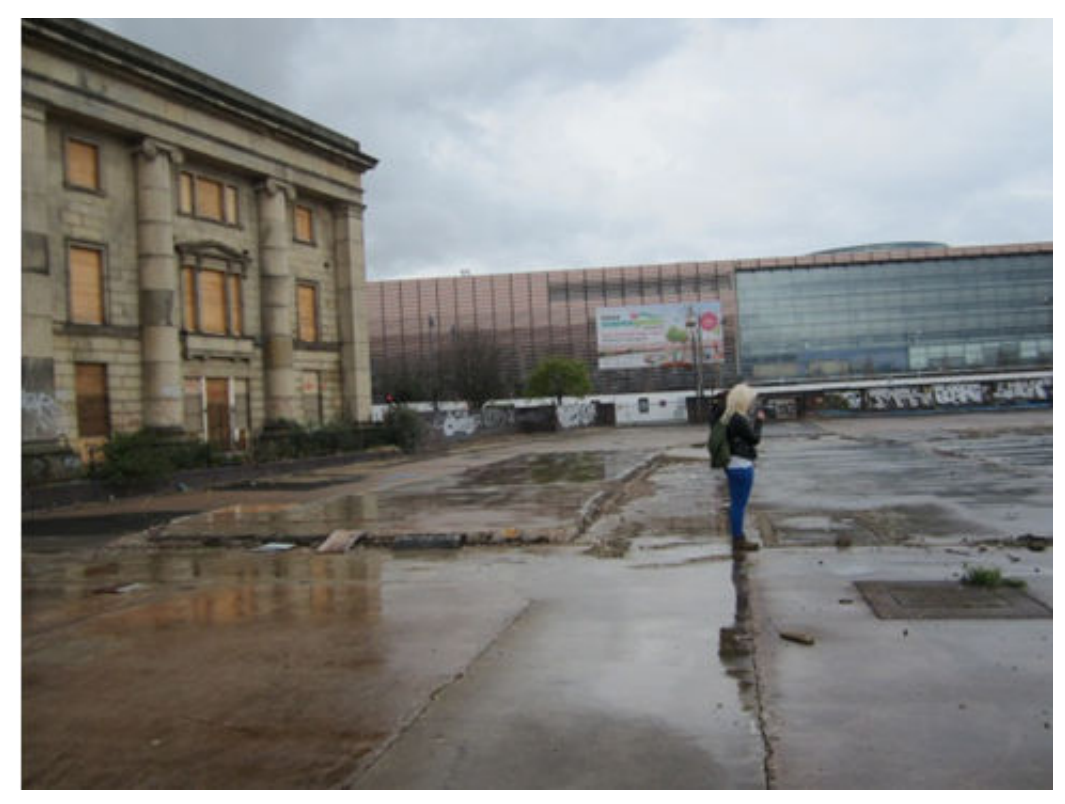
Figure 5. The 1838 Curzon Street railway entrance and Millennium Point