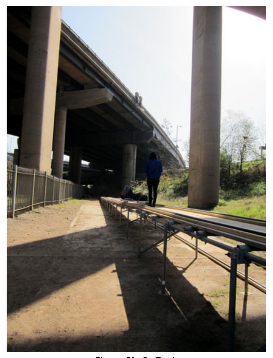
Figure 3b. On Track

4.2 This was own description of my experience of Track (see also Figure 3a and 3b):