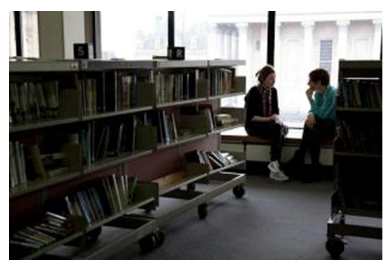
Figure 7. Mette Edvardsen's THFAITAS.

5.1 Norwegian artist Mette Edvardsen's work Time Has Fallen Asleep in The Afternoon Sunshine (THFAITAS) made an interesting intervention in (site-specific) time, foregrounding themes of memory and loss. In Edvardsen's work, five local volunteers joined three artists including the artist, and over a number of weeks learnt a book of their choice in order to become 'a living book'. They were based within the iconic Birmingham Central Library, a brutalist building which opened in 1974 and now faces imminent demolition once the new library (currently in construction) is completed (see Fulcher 2012). Over the course of eight days (Friday 30 March – Saturday 7 April 2012), visitors could book half-hour slots with the living book of their choice. They would be met by the 'book', taken somewhere within the library, and would be 'read' the story in the form of having it spoken to them from memory.