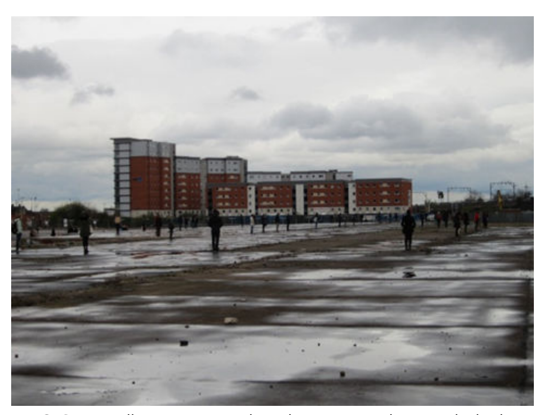
Figure 6. Group Walk participants with student accommodation in the background

4.10 Our 'walk' was, as I wrote in my research notes, a 'non-walk, or perhaps an anti-walk'. Participants were asked to choose one of the many straight lines on the car park's surface and then walk the length of that line, in silence, for two hours. Some of the lines were no more than ten metres long. As the starting gong was sounded, a hush fell. Tim Edensor (2007:224) writes how,