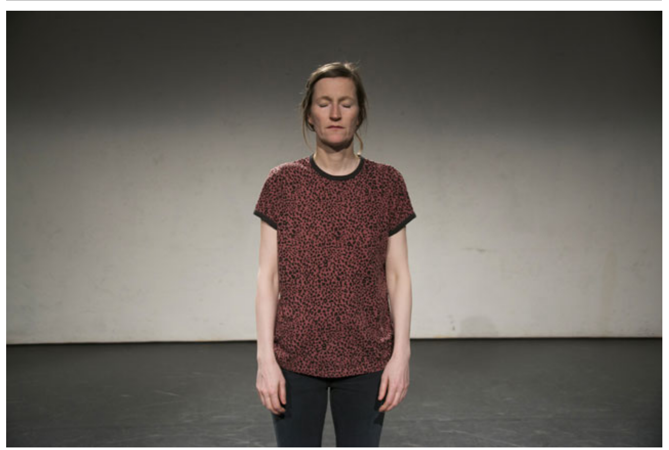
Mette Edvardsen performing No Title at Far Festival Nyon, 2014.