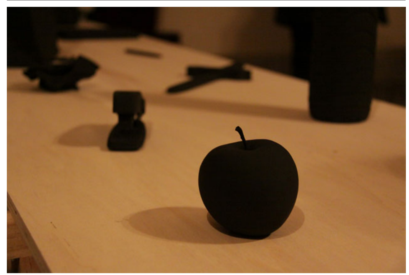
Mette Edvardsen. Black. Still life.