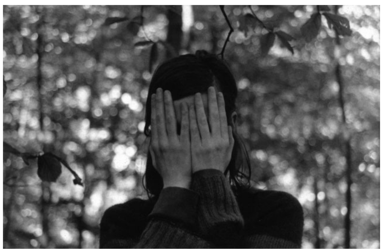
Mette Edvardsen performing Black in Madrid, 2016.

Oslo will be performed at the <u>Black Box Teater</u>, <u>Oslo</u>, Norway, on 9, 10 and 11 March 2017, and at <u>Performatik</u>, <u>Kaaistudio's</u>, <u>Brussels</u>, on 28 and 29 March 2017.